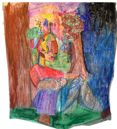
Kenneth Arnold at Boheme

These outdoor events have been CANCELED - It's too dang hot! Visit them in October!